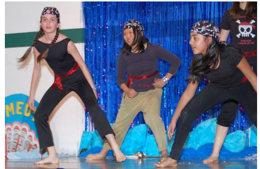
H2Oh! All-School Music Show Pirates of the Caribbean - middle school girls

The All-School Music Show was H2Oh! and included songs and dances about water.