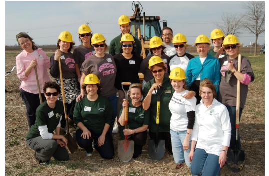
Faculty and staff at the groundbreaking ceremony.