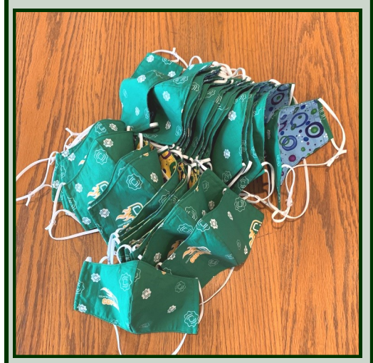
Face masks from custom Countryside logo material handmade by an anonymous family

These gestures of kindness were greatly appreciated.